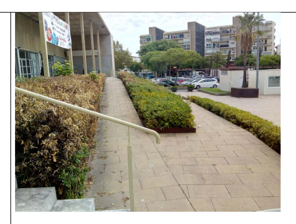
Call area Size: 11 x 5 m